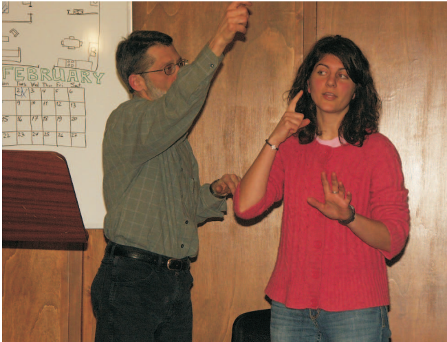
Explaining the verb “point”

I actually did short, evangelistic Bible studies. I closed every class in prayer. We were amazed that all of the students listened carefully each week to the gospel teaching.