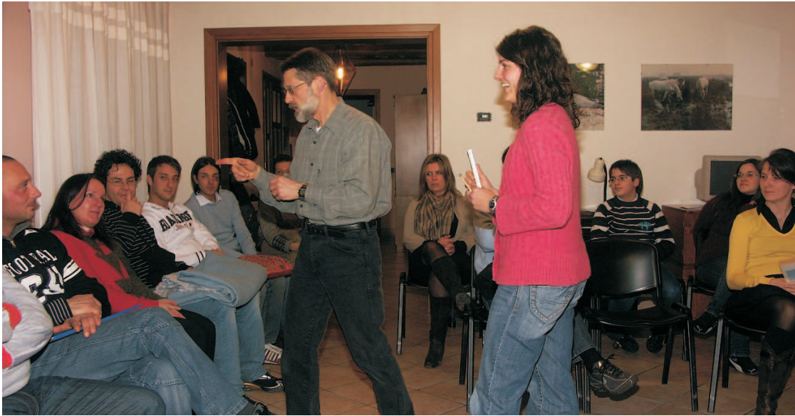
Nonstop interaction and talking for over an hour.