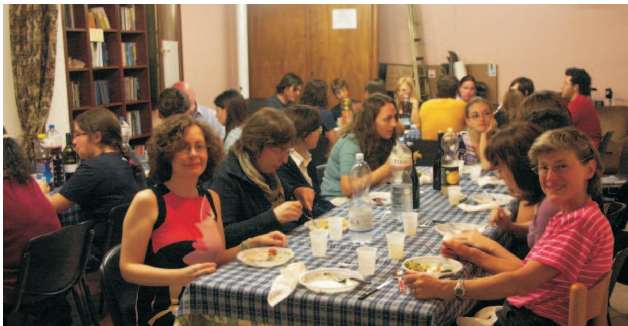
A picture of most of the group. The students loved being here.