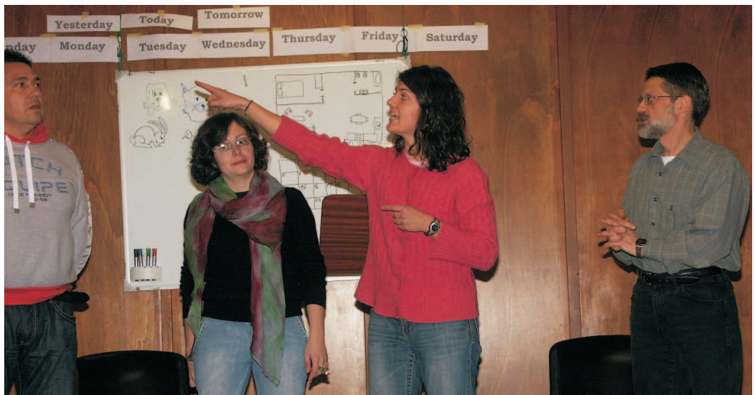
Having students help with demonstrating actions

This past Tuesday, we had a closing potluck dinner for all of the students. There were 20 nonbelievers present. They loved the evening. As they all expected, we had an evangelistic Bible study for them. They want to continue to have contact with us, and so we plan to invite them every two or three weeks for some kind of gathering, in which we can have some time in English, and then continue sharing the gospel in Italian. We