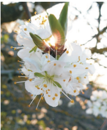
Spring: light and new life in Italy