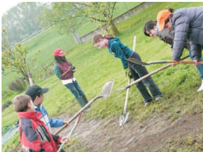
Youth Group: the youth serving

Pray for our youth meeting every 1st and 3rd Saturday of the month. We're now holding it at a park in Rovigo where we pray more youth will join us. Pray for the souls of the children in our church.